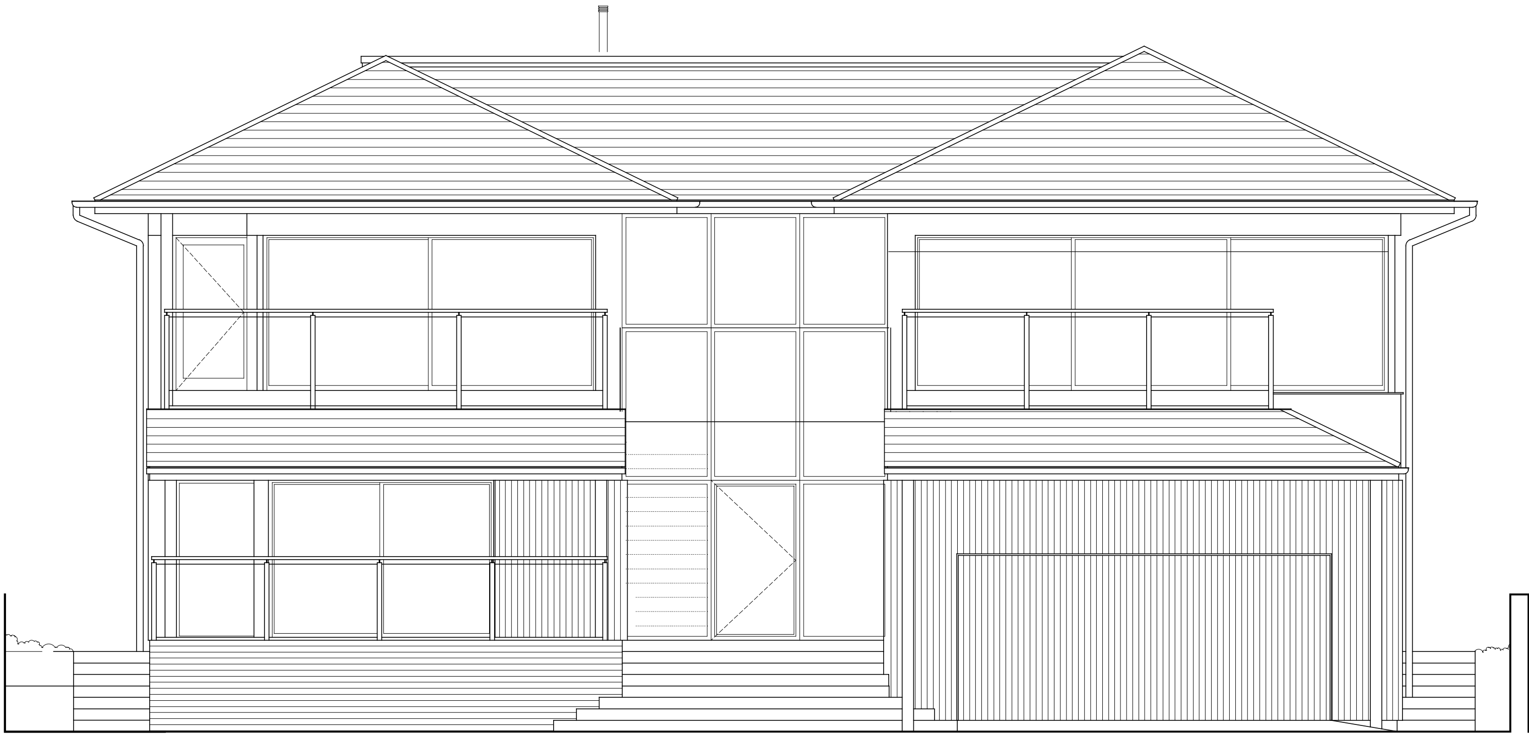
front elevation scale 1:50

RADON POTENTIAL: LESS THAN 1% THEREFORE ADOPT BASIC RADON PROTECTION.